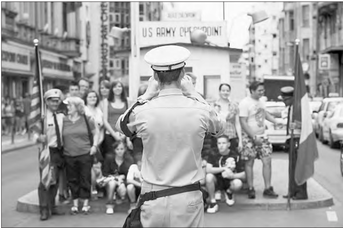
A performing artist dressed as a U.S. military police officer takes a photo of a group of tourists at Checkpoint Charlie in Berlin earlier this summer.