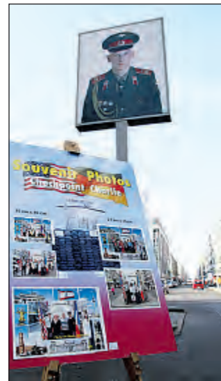
A souvenir photo display at Checkpoint Charlie in Berlin, popular with tourists.